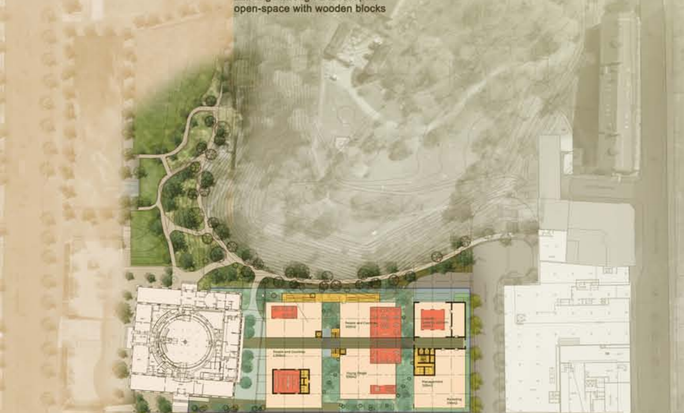
Master plan 1/1000

Public general entrance Relation between new and old buildings through a landscaped open-space with wooden blocks