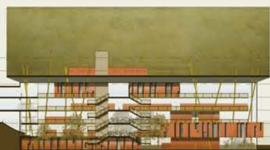
Cross section 1/500