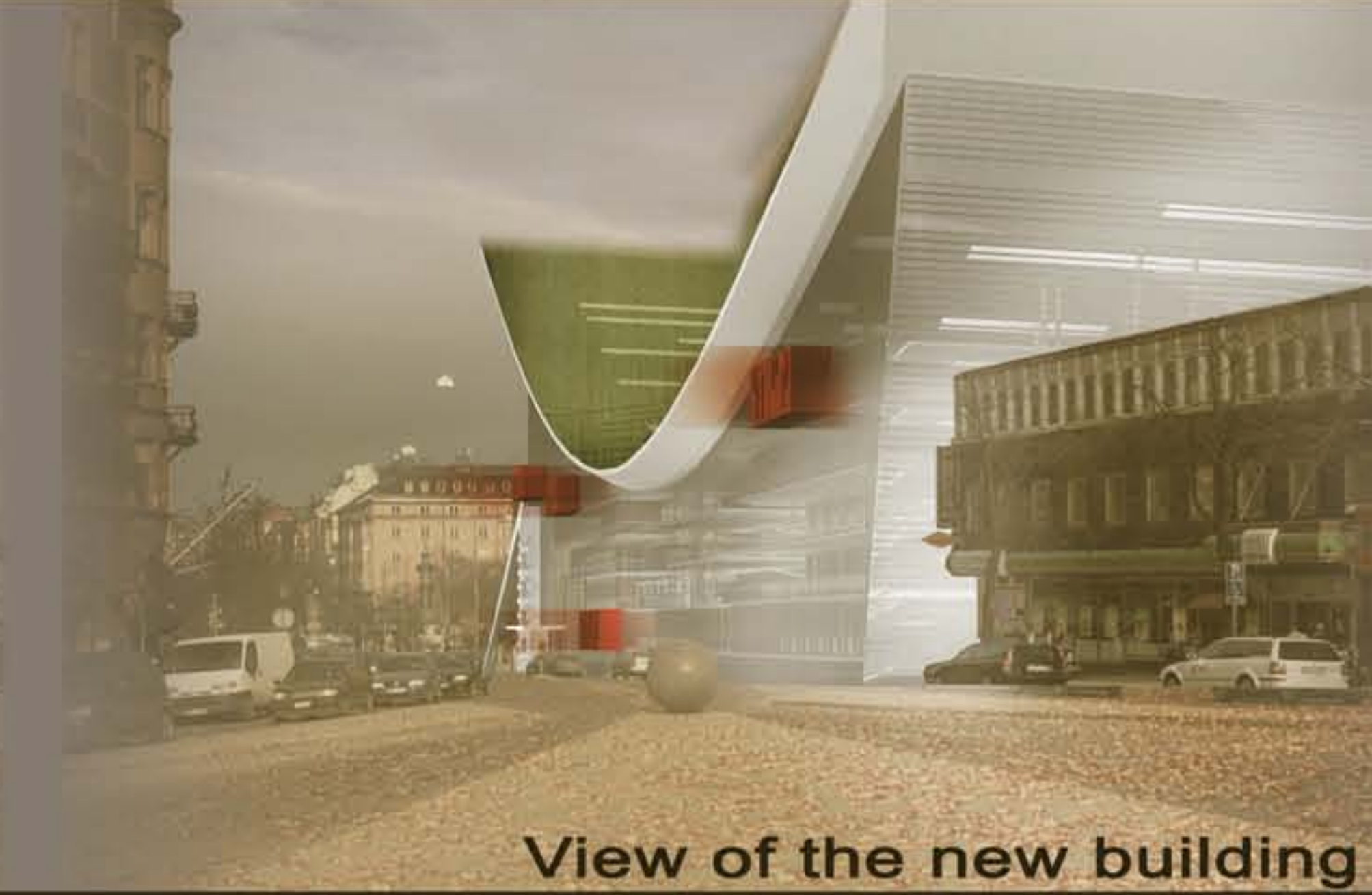
View of the new building