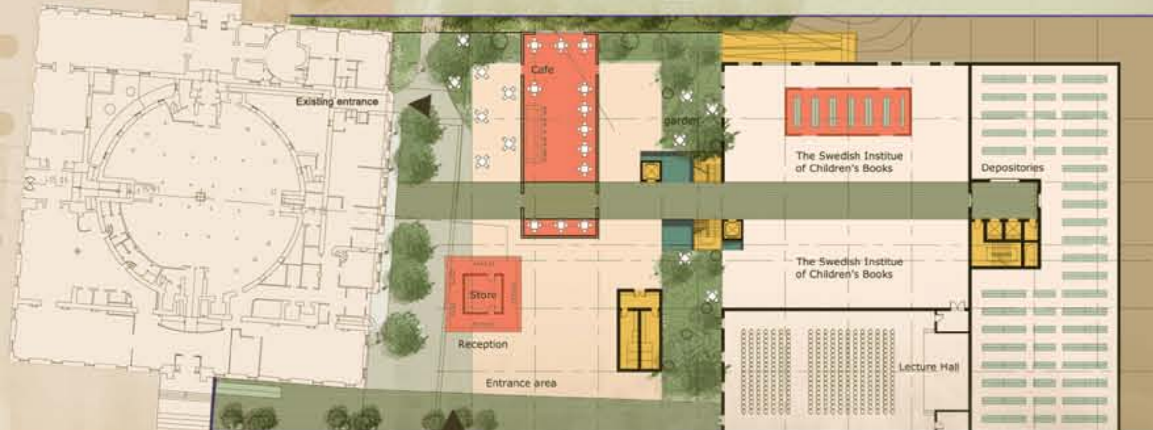
1st level 1/500

Public general entrance Relation between new and old buildings through a landscaped open-space with wooden blocks