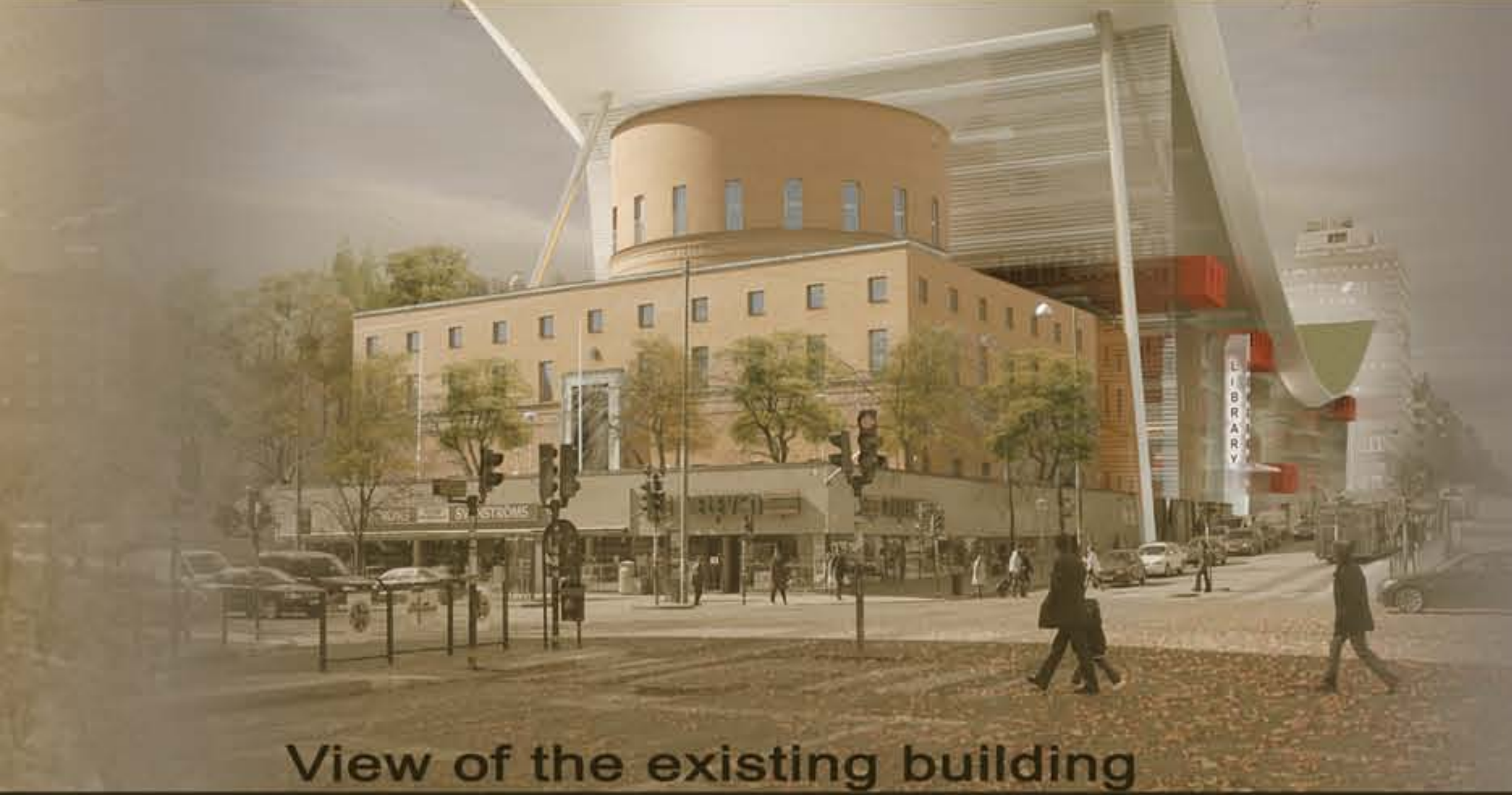
View of the existing building