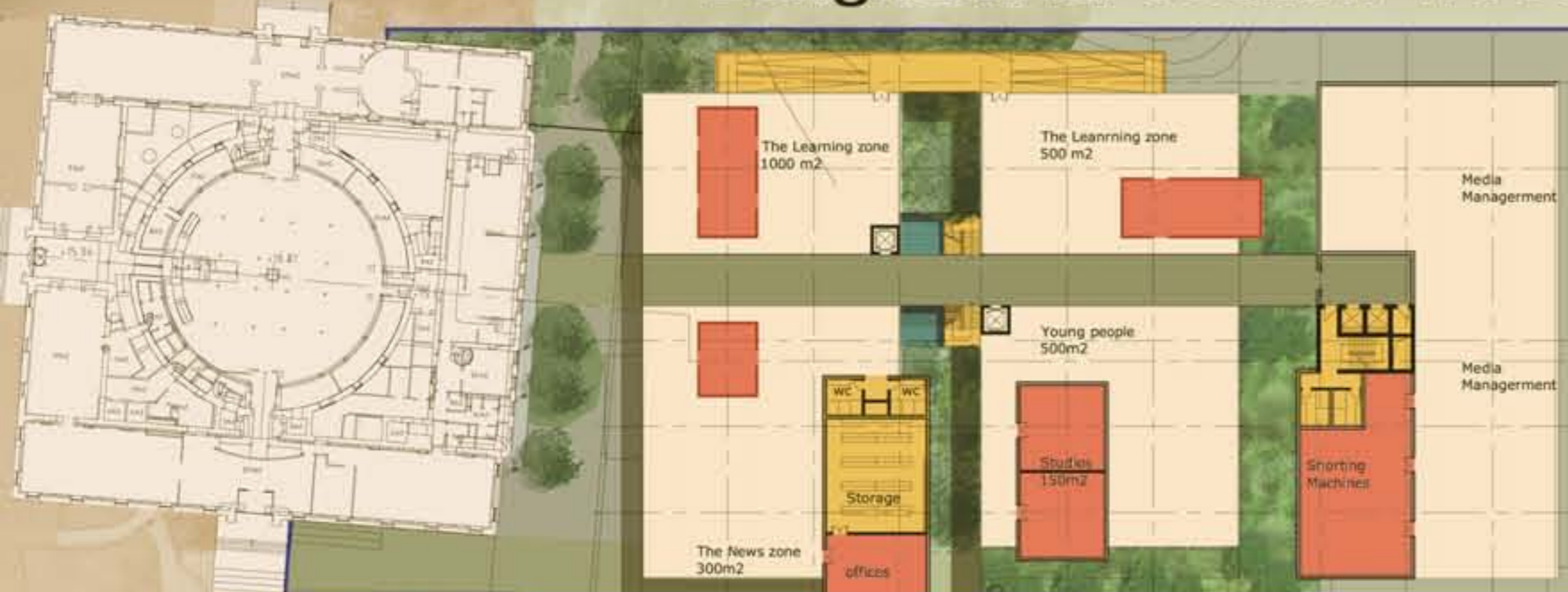
2nd level 1/500